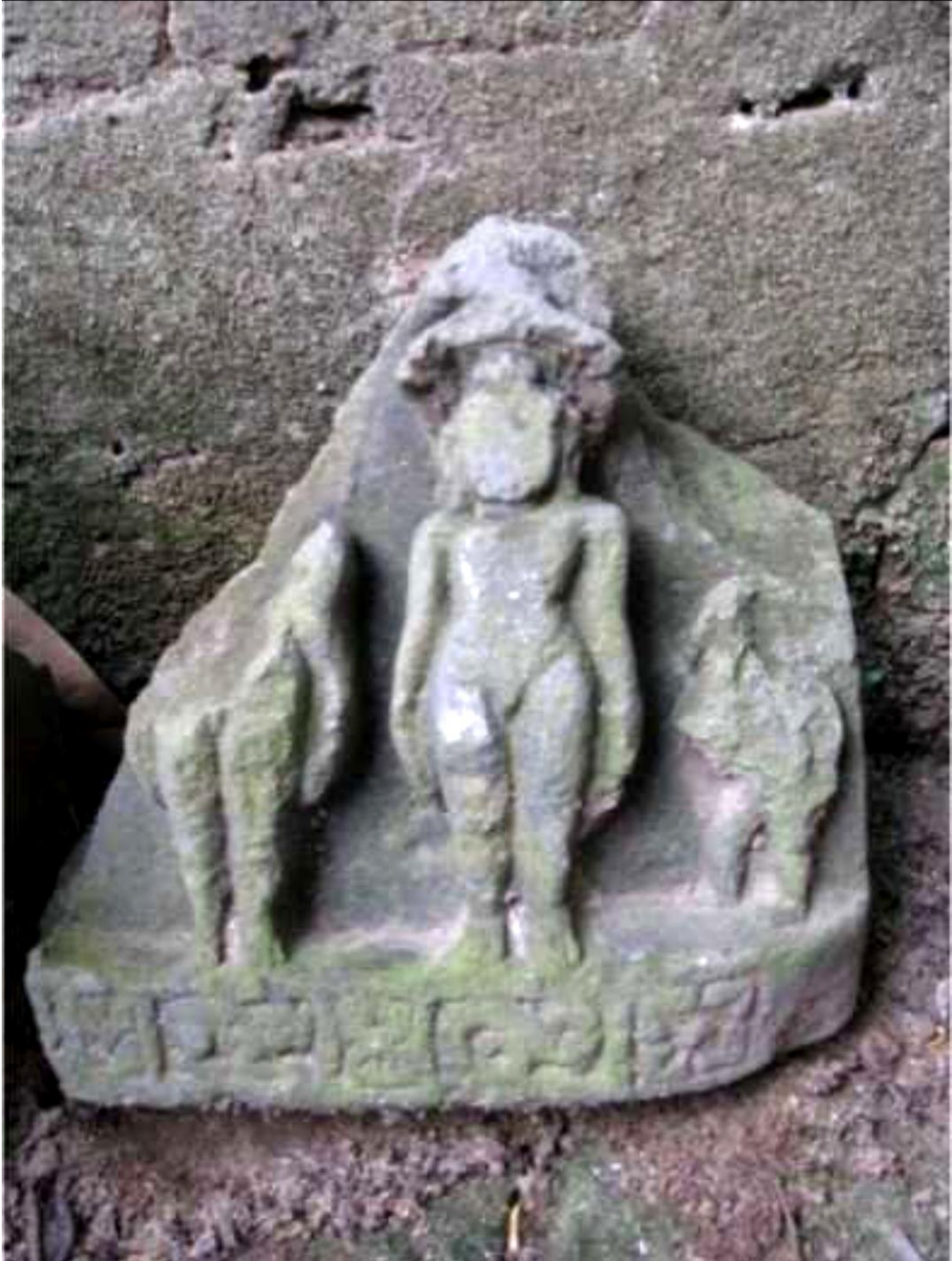
PLATE 4 : Dvitirthi Jaina Image, Sitalasvara, Jajpur District