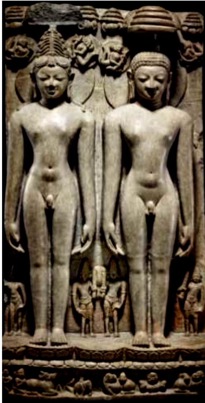
PLATE 1: Dvitirthi Jain Image, Odisha, British Museum, London