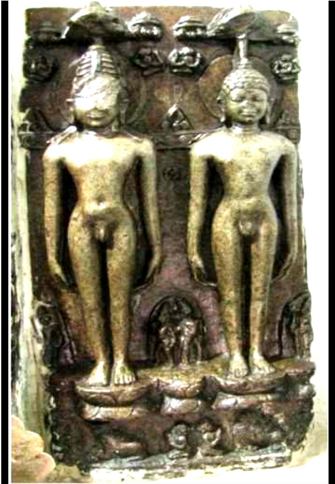
PLATE 3: Dvitirthi Jaina Image, Digambar Jain Temple, Choudhury Bazar, Cuttack District