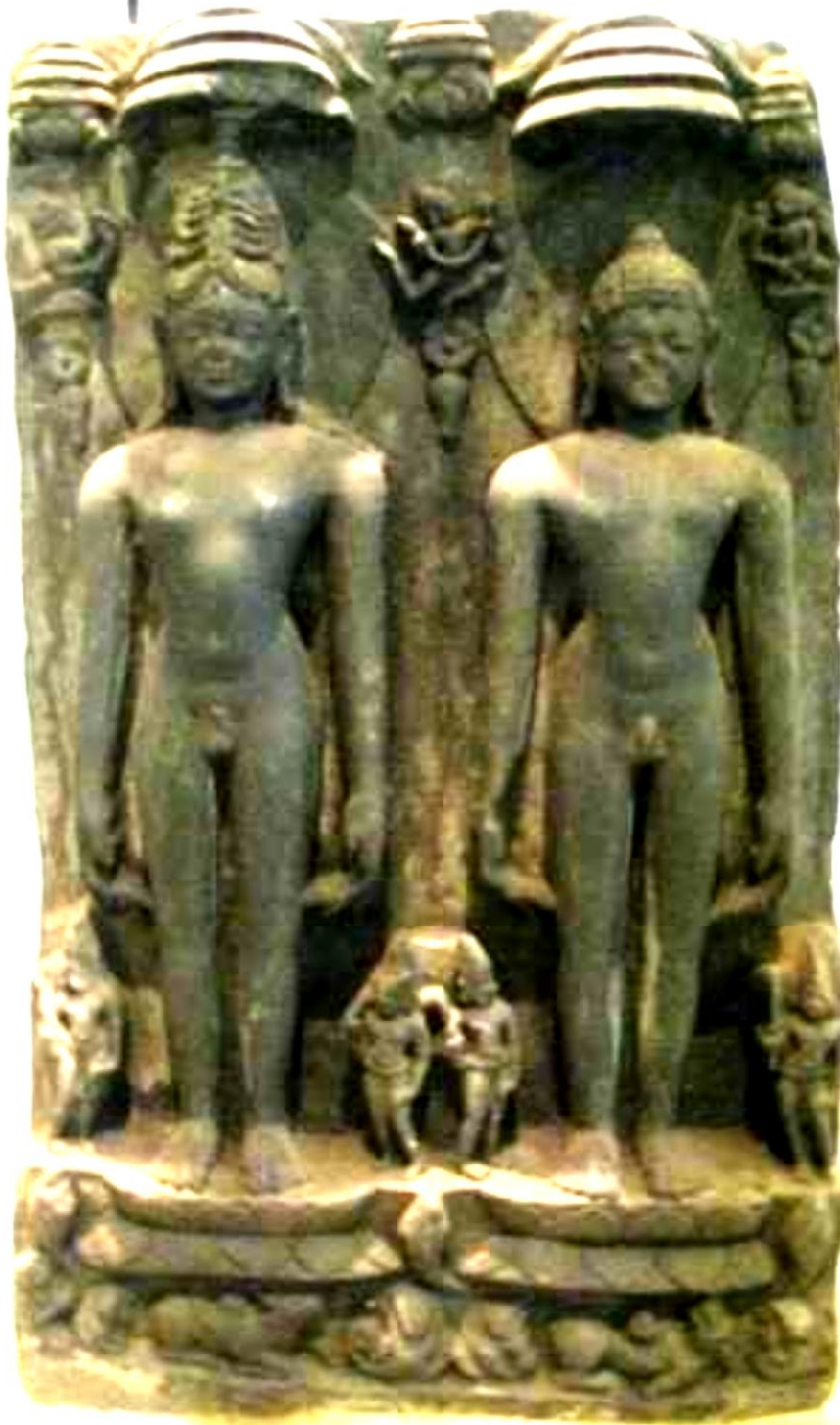
PLATE 2: Dvitirthi Jaina Image, Jain Heritage Museum,Pratap Nagari, Cuttack District